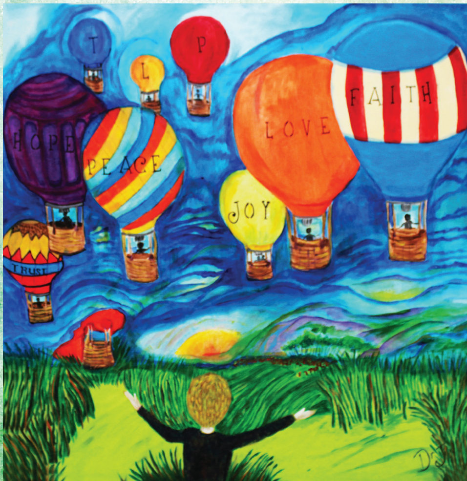
Artwork by Crosswinds Youth

It's interesting how value works. Most people take it for granted. The strange thing about it is once you lose something that's precious to you, that's when you value it the most. We have all lost something that was of value to us in some point in our lives. Maybe it was a treasured object, a friend, a family member, a pet or even yourself. There's an old saying that goes like this: when a door closes a window opens. The same goes for life. I can't speak for all of you but in a way I think we're kind of like family. Think about it, we all live under the same code of rules; we all go grocery shopping together. So in a way we are. That's what Crosswinds is, a window, a second chance or a new beginning in our lives. ... I would like to thank you all in this journey; we have all come so far in life. Remember the sky's the limit so reach for the stars and beyond!