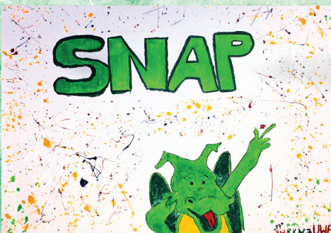
Artwork by Crosswinds Youth Funded by Variety